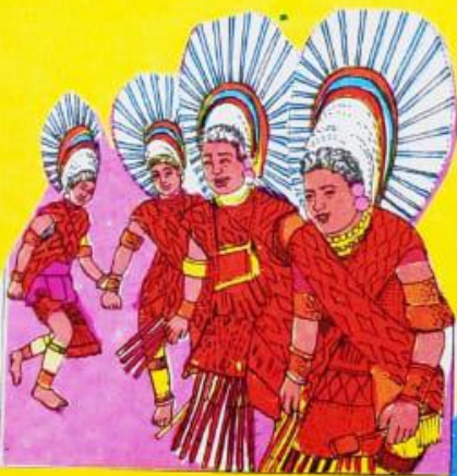
Folk dance of Nagaland