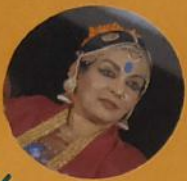
Mallika Sarabhai an Kuchipudi Dancer