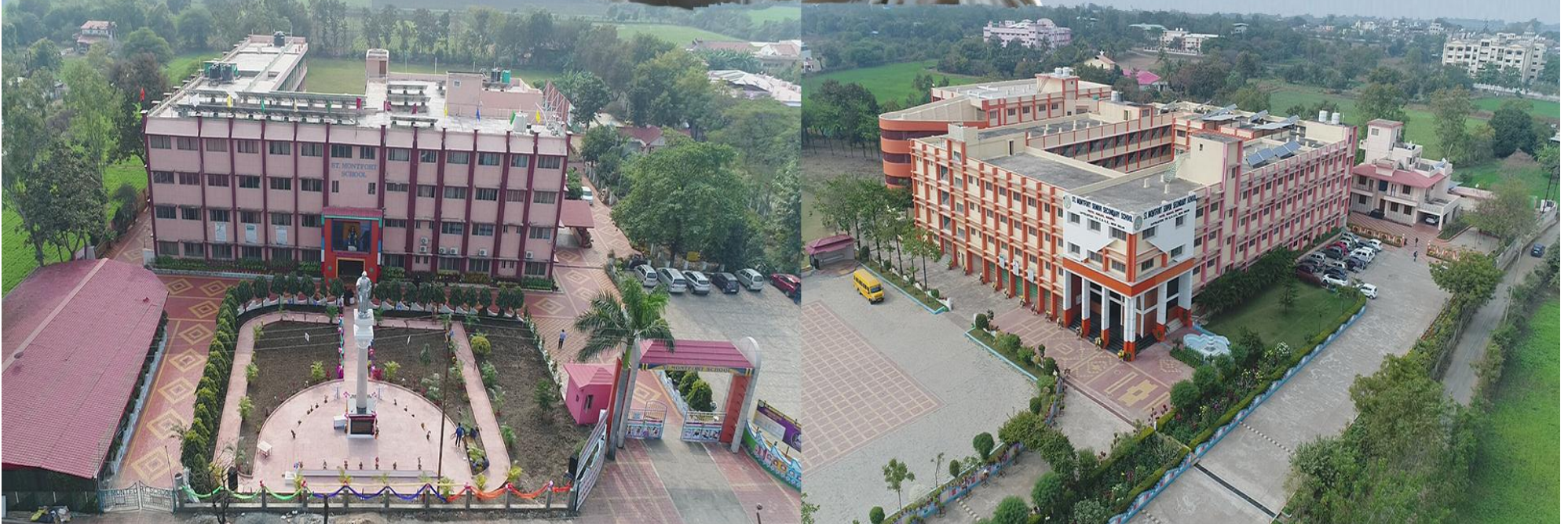
ST MONTFORT SR. SEC SCHOOL