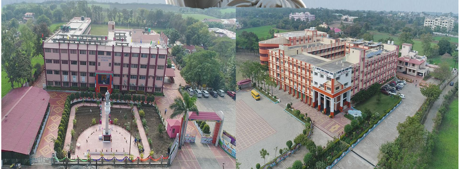
ST MONTFORT SR. SEC SCHOOL